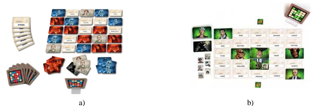
Figure 1. The Codenames game – (a) Standard and (b) Duet

Codenames: Duet is a special variant of the game more suitable for 2 players. Out of the 25 initial words, there are 15 words to be guessed in cooperation by the 2 players. Each player has a separate key with 9 words (out of those 15) to give a clue for. There are 3 "assassin" words for each of the players (the game immediately ends when one of these words is guessed).