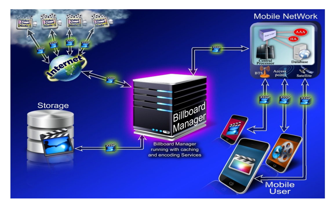
Figure 1. Proposed Caching Architecture

This directly translates in time savings as well. In the absence of a video not in its cached resource, the 3G mobile user requesting the service would be served with a controlled video stream. The mechanism of this would be managed in a manner such that the Billboard Manager initially begins caching chunks of the video from its own cloud-based nodes, and then sends from it, smaller streams to the 3G mobile device user. In this manner, the 3G mobile device user, after experiencing an initial time delay from the moment the user places the request to the time when the video starts on the device, enjoys an uninterrupted video stream thereon. Further, once a video is fully cached, the Billboard Manager can serve it from its resource to other mobile device users placing a request for it. This reduces overall bandwidth consumption as the Billboard Manager does not have to engage resources to obtain the video once again from its registered cloud-based nodes. The 3G mobile device user requesting the video only has to use their own (3G) network bandwidth and can do so with maximum effect with little or no delay between placing the request to the time the video starts playing. Thus, with the aid of this proposed model, a considerable amount of resources in terms of bandwidth, cost and time can be saved. Figure 1 shows the function of our proposed model.