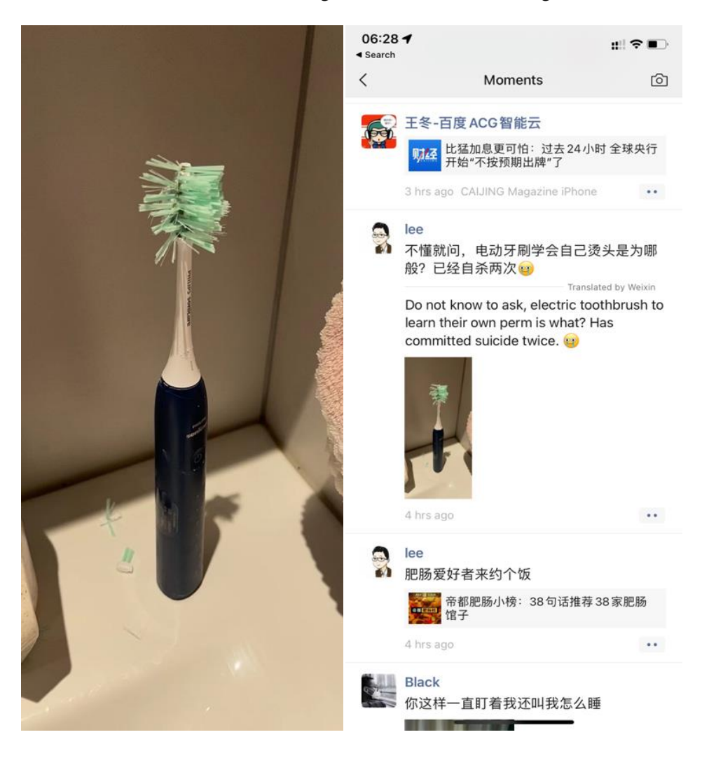
Figure 5. The electronic warfare's shockwave impact on the civil society in Beijing

On July 14, 2022 in Beijing when I tried to have an interview for the pending case and also confirm the integrity of the USCIS mail, I sensed a sudden DoS attack inside of the American Embassy in Beijing during the interview, and several persons on WeChat reported to me on the malfunctioning of their electronic devices. Figure 5 is an example of the polymer blast apart from another who reported on broken phone screen. The dictatorial reliance on artificial intelligence and the big data technologies can be a contributing factor for the applications of electronic warfare. [11] The PLA's conduct of Great Firewall & electronic warfare pose non-traditional nuclear threat to Beijing itself and imposes transgressions to the civil society's right to health. It has been causing public health crisis with such operations and grossly violating the Geneva Conventions. Detailed accounts of the investigations & research will be given elsewhere.