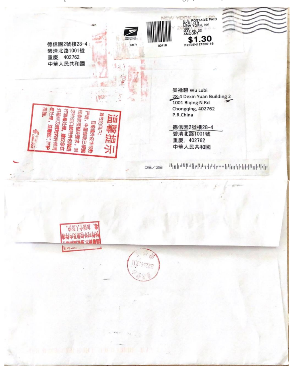
Figure 2. The front and back covers of the poison pen letter