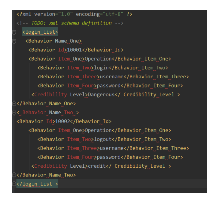
Figure 3-2 Result Display of XML Behavior Declaration File Generation