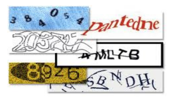
Figure 2 Hardware Parameter variation in HIPs

A few of the many different HIP styles that can be produced by manipulating hardness parameters are illustrated below (Figure 2).